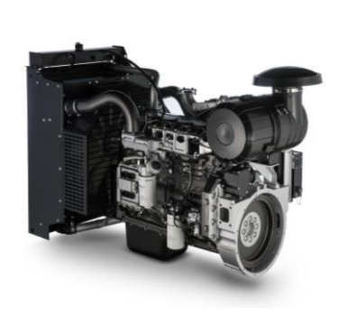
N67 - Technical Specifications

Engine Displacement (liters): 6.7 Cylinder Arrangement: in-line 4